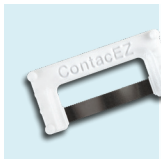
White Serrated Strip The Gentle Saw, Interproximal Cement Cleaner No Diamond • Double-Serrated REF 31408

This ultra-thin serrated strip is designed to safely cut and clean out excess cement trapped in the interproximal space after cementation. Prior to light-curing, use it for interproximal cleaning of multiple veneers or composite fillings without disturbing placement and to separate them from adjacent teeth. Gently pass the strip back and forth buccolingually only.