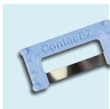
Blue Serrated Strip The Heavy-Duty Dental Saw No Diamond • Double-Serrated REF 31508

This ultra-thin serrated strip is designed to safely cut and clean out excess cement trapped in the interproximal space after cementation. Prior to light-curing, use it for interproximal cleaning of multiple veneers or composite fillings without disturbing placement and to separate them from adjacent teeth. Gently pass the strip back and forth buccolingually only.