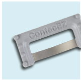
Gray Final Polishing Strip The Proximal Surface Polisher Extra-Fine Diamond • Single-Sided REF 31308

Use this strip to polish proximal contact surfaces of restorations and to restore a natural finish in one step. This strip also confirms interproximal relief (IR)* after definitive cementation. For interproximal stain removal and cleaning, use the Hygienist Strip, Stain Remover .