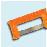
Orange Serrated Diamond Strip The Proximal Contact Adjuster with Sawtooth Extra-Fine Diamond • Single-Sided • Double-Serrated REF 31208

Use the Black Diamond Strip to adjust ideal proximal contacts and restore interproximal relief (IR)* by eliminating excessive pressure between the indirect restoration and the adjacent teeth without opening the contact. Use this strip prior to definitive cementation of crowns, inlays/onlays, and veneers. It is also useful to contour proximal surfaces of composite fillings.